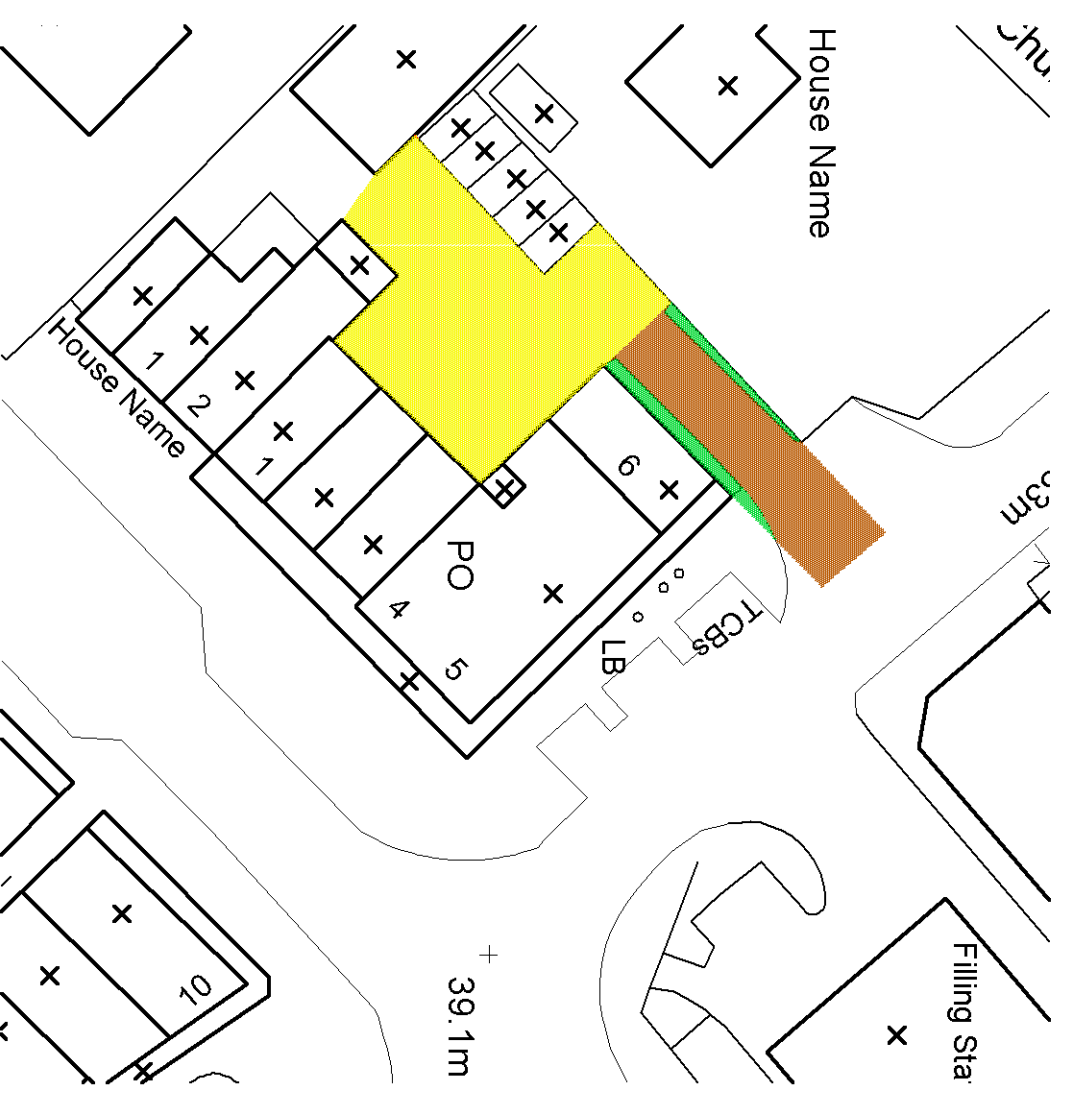
Site Plan (1:500)